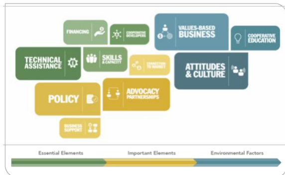
Figure 1. The Worker Cooperative Ecosystem

Worker cooperatives thrive not only where policy and government agencies are supportive, but also where there are supportive organizations that together form an “ecosystem” for worker cooperatives. A worker cooperative ecosystem includes worker cooperative advocates, incubators, financing organizations, technical support agencies, and other enabling groups. Cities where worker cooperatives exist in higher numbers (such as New York, Madison, WI, Cleveland, and the San Francisco Bay Area) have such ecosystems present to some degree – some of which were created organically and some of which were developed as a result of local policy. These cities have seen a direct and clear return on investment in the form of economic development. Currently, Chicago is NOT among these cities.